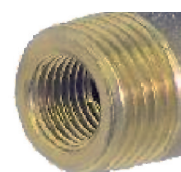
Dual inlet: 1/2" / 1/4"