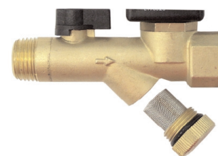
Combo valve with ball valve and strainer